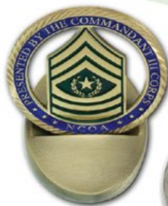
Zinc Coin Stand