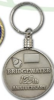
Key Coin Holder