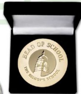
Acrylic Coin Holder