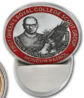
Pewter Coin Stand