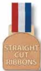
Straight Cut Ribbons