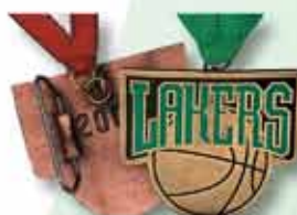
Convert Medal to Buckle