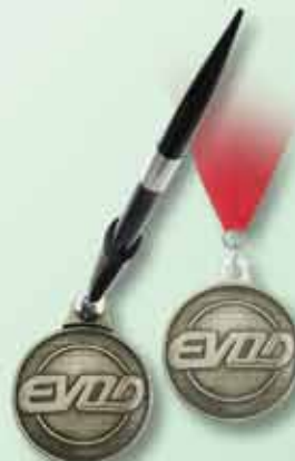
Convert Medal to Pen Stand